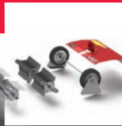
BDR-650V drum mower Working width: 62,2 cm Clutch diameter: 80 mm Article no.: 4399