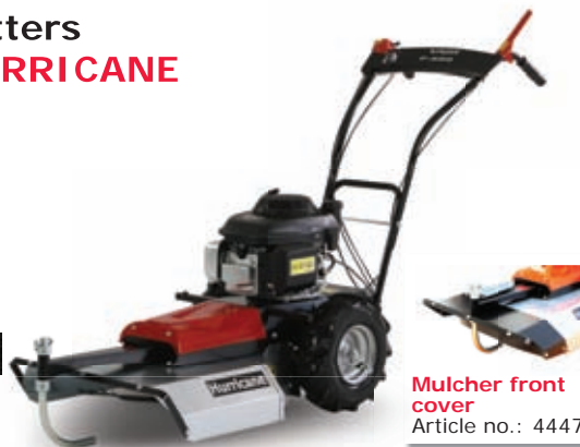
Mulcher front cover Article no.: 4447