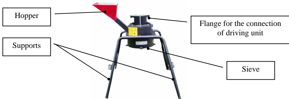
Fig. 1: Crusher